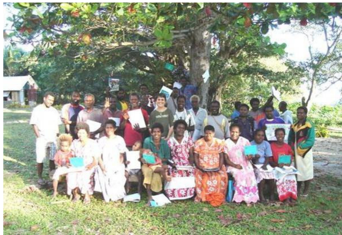
Vanuatu: Participants of Workshop, Tanna

During the implementation phase of the project, community development agenda were negotiated with newly elected authorities in 14 Q'eqchi townships. In addition, the project has produced significant changes: voter registration in the Q'eqchi region increased by 37 percent compared to 2003; the participation of women and young people rose by 40 percent and abstentions were reduced by 8 percent; and the 2007 elections were free of fraud or violence during the elections. The most concrete achievement was that six native Q'eqchi were elected as Mayors and four as Congressmen from their districts. These achievements point to a brighter future of the Q'eqchi populations in Guatemala.