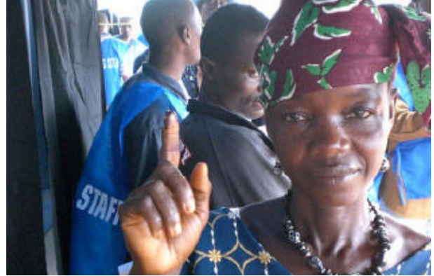
Sierra Leone: A woman has finished voting during the 2007 elections

In May 2002, Sierra Leone held its second multiparty presidential and parliamentary elections, after eleven years of civil war. Since then, Sierra Leone has been a country in steady recovery. And one of the most effective ways to mobilize public support for democracy and human rights is through the media. UNDEF supports a two-year project entitled "Democracy, Human Rights and Media in Sierra Leone" implemented by a CSO, Journalists for Human Rights (JHR) intended to "bolster the media's ability to act as a medium of human rights and democratic information".